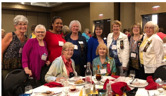
Washington State attendees