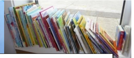
Beta's library @ Lunar Laundry