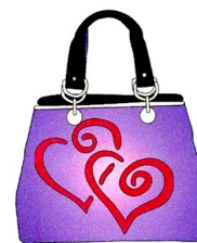
DKG Washington Purpose-Filled Purse™ Project