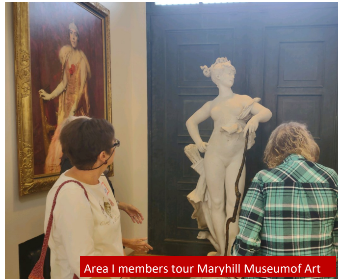
Area I members tour Maryhill Museum of Art