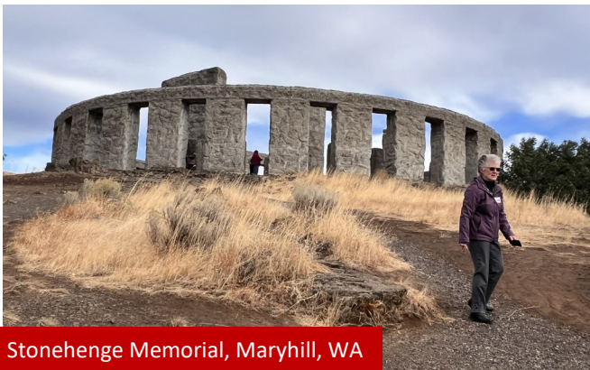
Stonehenge Memorial, Maryhill, WA